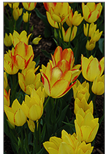
Georgette Tulip flowers