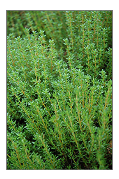
Common Thyme foliage