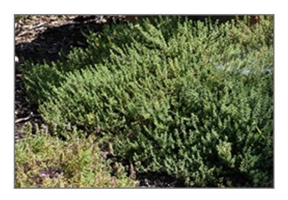
Common Thyme

This plant is quite ornamental as well as edible, and is as much at home in a landscape or flower garden as it is in a designated herb garden. It should only be grown in full sunlight. It prefers to grow in average to dry locations, and dislikes excessive moisture. It is considered to be drought-tolerant, and thus makes an ideal choice for a low-water garden or xeriscape application. It is not particular as to soil type or pH. It is highly tolerant of urban pollution and will even thrive in inner city environments. Consider covering it with a thick layer of mulch in winter to protect it in exposed locations or colder microclimates. This species is not originally from North America. It can be propagated by division.