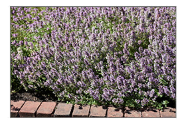
Common Thyme in bloom

Common Thyme is smothered in stunning clusters of pink flowers at the ends of the stems from early to mid summer. Its attractive tiny fragrant round leaves remain grayish green in color throughout the year.