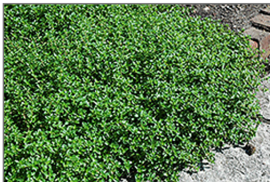
Spanish Thyme