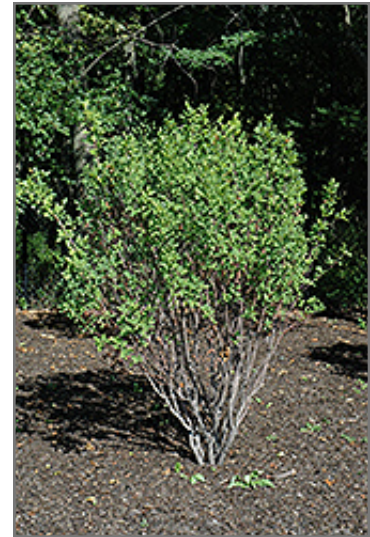
Rainbow Pillar Serviceberry

Rainbow Pillar Serviceberry is a dense multi-stemmed deciduous shrub with a narrowly upright and columnar growth habit. Its relatively fine texture sets it apart from other landscape plants with less refined foliage.