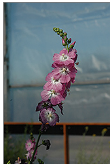
Stark's Hybrids Prairie Mallow flowers