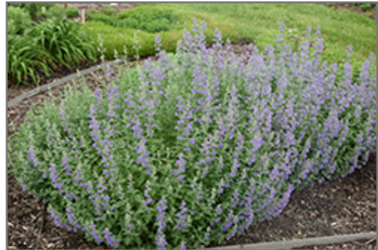
Walker's Low Catmint in bloom

Walker's Low Catmint is recommended for the following landscape applications;