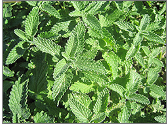
Walker's Low Catmint foliage

Walker's Low Catmint will grow to be about 12 inches tall at maturity extending to 16 inches tall with the flowers, with a spread of 12 inches. Its foliage tends to remain dense right to the ground, not requiring facer plants in front. It grows at a fast rate, and under ideal conditions can be expected to live for approximately 10 years. As an herbaceous perennial, this plant will usually die back to the crown each winter, and will regrow from the base each spring. Be careful not to disturb the crown in late winter when it may not be readily seen!