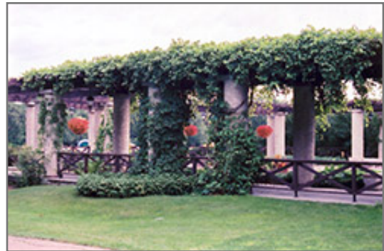
Virginia Creeper