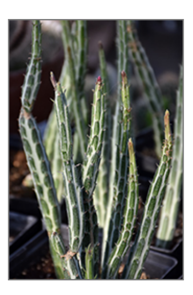
Pickle Plant foliage

When grown indoors, Pickle Plant can be expected to grow to be about 10 inches tall at maturity, with a spread of 18 inches. It grows at a medium rate, and under ideal conditions can be expected to live for approximately 10 years. This houseplant will do well in a location that gets either direct or indirect sunlight, although it will usually require a more brightly-lit environment than what artificial indoor lighting alone can provide. It prefers dry to average moisture levels with very well-drained soil, and may die if left in standing water for any length of time. This plant should be watered when the surface of the soil gets dry, and will need watering approximately once each week. Be aware that your particular watering schedule may vary depending on its location in the room, the pot size, plant size and other conditions; if in doubt, ask one of our experts in the store for advice. It is not particular as to soil pH, but grows best in sandy soil. Contact the store for specific recommendations on pre-mixed potting soil for this plant.