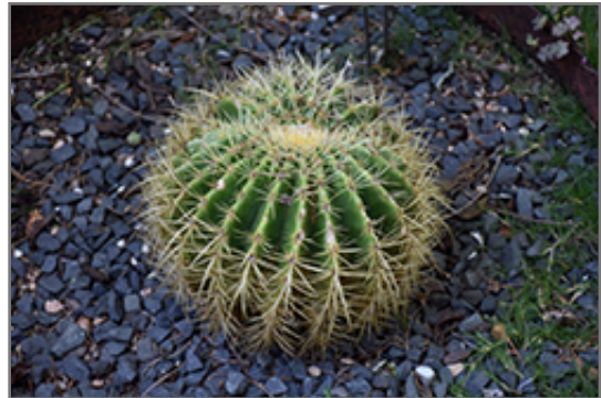
Golden Barrel Cactus

Golden Barrel Cactus is a succulent evergreen plant. It is a member of the cactus family, which are grown primarily for their characteristic shapes, their interesting features and textures, and their high tolerance for hot, dry growing environments. Like all cacti, it doesn't actually have leaves, but rather modified succulent stems that comprise the bulk of the plant, and which are designed to hold water for long periods of time. This particular cactus is valued for its distinctive barrel shape, and usually grows as a single spiny ribbed green stem. This plant has yellow cup-shaped flowers held atop the stems from late spring to early summer, which are interesting on close inspection.