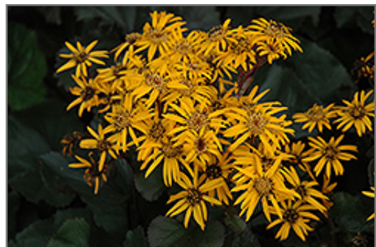
Britt Marie Crawford Rayflower flowers