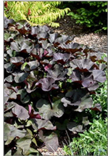
Britt Marie Crawford Rayflower foliage

This plant does best in partial shade to shade. It prefers to grow in moist to wet soil, and will even tolerate some standing water. It is not particular as to soil pH, but grows best in rich soils. It is somewhat tolerant of urban pollution. This is a selected variety of a species not originally from North America. It can be propagated by division; however, as a cultivated variety, be aware that it may be subject to certain restrictions or prohibitions on propagation.