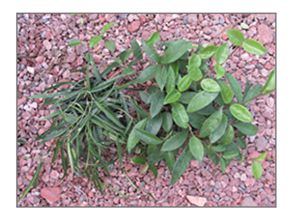
Jade Wax Plant

When grown indoors, Jade Wax Plant can be expected to grow to be about 5 feet tall at maturity, with a spread of 12 inches. It grows at a medium rate, and under ideal conditions can be expected to live for approximately 10 years. This houseplant should be situated in a location that that gets indirect sunlight at most, although it will usually require a more brightly-lit environment than what artificial indoor lighting alone can provide. It is very adaptable to both dry and moist soil, but will not tolerate any standing water. The surface of the soil shouldn't be allowed to dry out completely, and so you should expect to water this plant once and possibly even twice each week. Be aware that your particular watering schedule may vary depending on its location in the room, the pot size, plant size and other conditions; if in doubt, ask one of our experts in the store for advice. It is particular about its soil conditions, with a strong preference for rich, acidic soil. Contact the store for specific recommendations on pre-mixed potting soil for this plant.