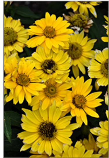
Tuscan Gold False Sunflower flowers

This is a relatively low maintenance plant, and is best cleaned up in early spring before it resumes active growth for the season. It is a good choice for attracting butterflies to your yard. It has no significant negative characteristics.