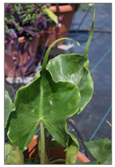
Stingray Elephant's Ear foliage