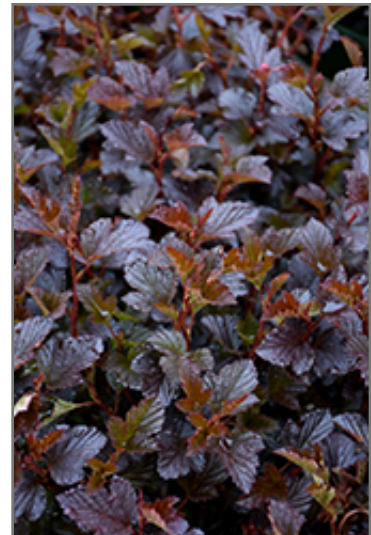
Petite Plum Ninebark foliage