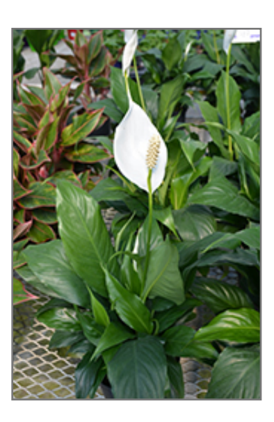
Sensation Peace Lily in bloom

When grown indoors, Sensation Peace Lily can be expected to grow to be about 5 feet tall at maturity, with a spread of 3 feet. It grows at a medium rate, and under ideal conditions can be expected to live for approximately 10 years. This houseplant performs well in both bright or indirect sunlight and strong artificial light, and can therefore be situated in almost any well-lit room or location. It prefers to grow in average to moist soil. The surface of the soil shouldn't be allowed to dry out completely, and so you should expect to water this plant once and possibly even twice each week. Be aware that your particular watering schedule may vary depending on its location in the room, the pot size, plant size and other conditions; if in doubt, ask one of our experts in the store for advice. It is particular about its soil conditions, with a strong preference for rich, acidic soil. Contact the store for specific recommendations on pre-mixed potting soil for this plant. Be warned that parts of this plant are known to be toxic to humans and animals, so special care should be exercised if growing it around children and pets.