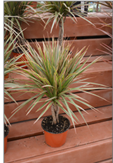
Colorama Dracaena in full

This is an herbaceous evergreen houseplant with an upright spreading habit of growth. Its relatively coarse texture stands it apart from other indoor plants with finer foliage. This plant may benefit from an occasional pruning to look its best.