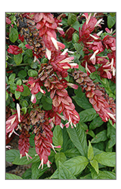
Shrimp Plant flowers

When grown indoors, Shrimp Plant can be expected to grow to be about 3 feet tall at maturity, with a spread of 3 feet. It grows at a fast rate, and under ideal conditions can be expected to live for approximately 10 years. This houseplant will do well in a location that gets either direct or indirect sunlight, although it will usually require a more brightly-lit environment than what artificial indoor lighting alone can provide. It prefers to grow in average to moist soil. The surface of the soil shouldn't be allowed to dry out completely, and so you should expect to water this plant once and possibly even twice each week. Be aware that your particular watering schedule may vary depending on its location in the room, the pot size, plant size and other conditions; if in doubt, ask one of our experts in the store for advice. It is not particular as to soil type or pH; an average potting soil should work just fine.