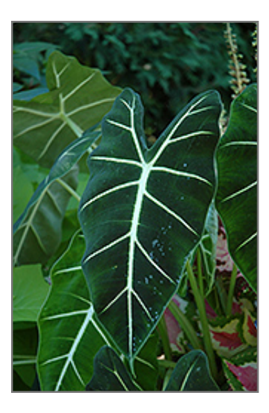
Frydek Elephant's Ear foliage

When grown indoors, Frydek Elephant's Ear can be expected to grow to be about 3 feet tall at maturity, with a spread of 3 feet. It grows at a medium rate, and under ideal conditions can be expected to live for approximately 5 years. This houseplant will do well in a location that gets either direct or indirect sunlight, although it will usually require a more brightly-lit environment than what artificial indoor lighting alone can provide. It is quite adaptable, prefering to grow in average to wet conditions, and will even tolerate some standing water. The surface of the soil should be kept consistently moist all of the time, and you should expect to water this plant two or more times each week, especially if it's growing in a low-humidity environment. Be aware that your particular watering schedule may vary depending on its location in the room, the pot size, plant size and other conditions; if in doubt, ask one of our experts in the store for advice. It is not particular as to soil type or pH; an average potting soil should work just fine. Be warned that parts of this plant are known to be toxic to humans and animals, so special care should be exercised if growing it around children and pets.