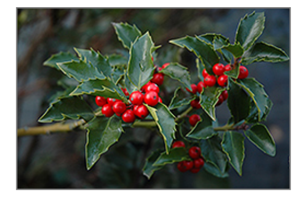
Blue Girl Meserve Holly fruit

Blue Girl Meserve Holly is a dense multi-stemmed evergreen shrub with a more or less rounded form. Its average texture blends into the landscape, but can be balanced by one or two finer or coarser trees or shrubs for an effective composition.