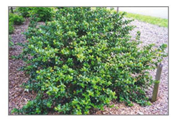
Blue Girl Meserve Holly

This is a relatively low maintenance shrub, and is best pruned in late winter once the threat of extreme cold has passed. It is a good choice for attracting birds to your yard. It has no significant negative characteristics.