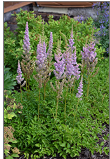
Dwarf Chinese Astilbe in bloom