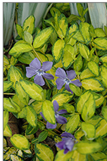
Illumination Periwinkle flowers