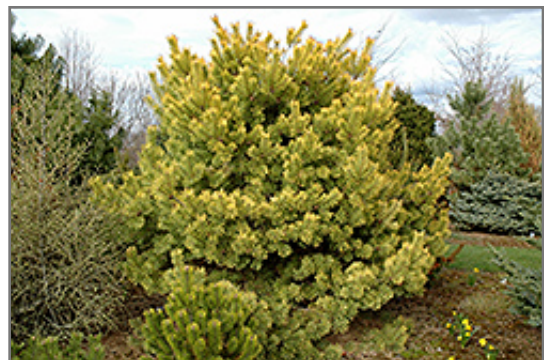
Golden Scotch Pine