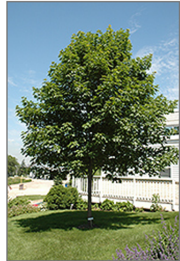
Fall Fiesta Sugar Maple

* This is a 'special order' plant - contact store for details