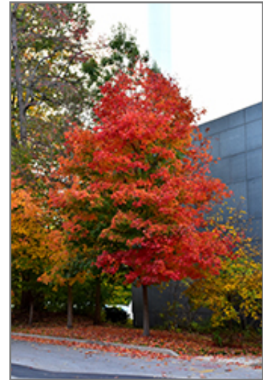
Fall Fiesta Sugar Maple in fall

Fall Fiesta Sugar Maple is recommended for the following landscape applications;