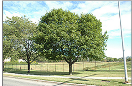
Norway Maple