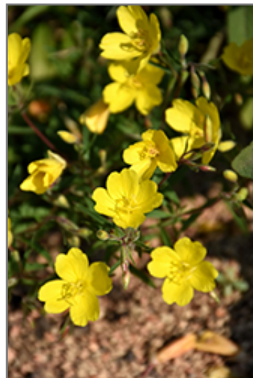
Lemon Drop Primrose flowers

Lemon Drop Primrose is recommended for the following landscape applications;