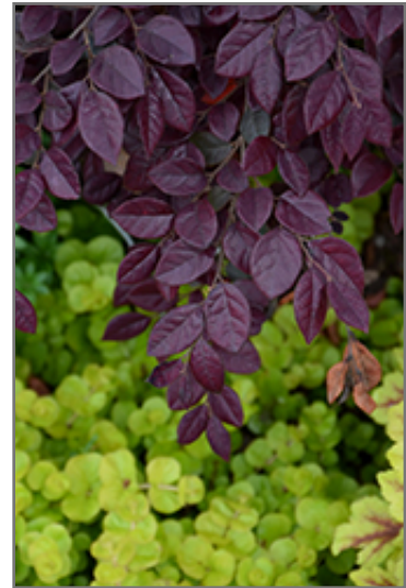
Crimson Fire Chinese Fringeflower foliage

* This is a 'special order' plant - contact store for details