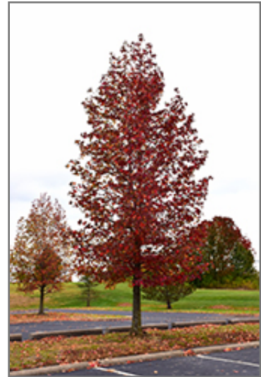
Happidaze Sweet Gum in fall