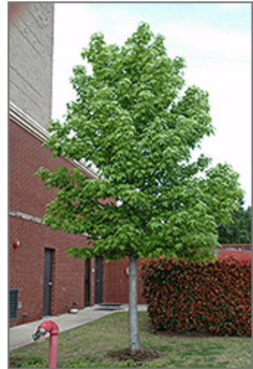
Happidaze Sweet Gum

* This is a 'special order' plant - contact store for details