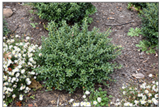
Soft Touch Japanese Holly