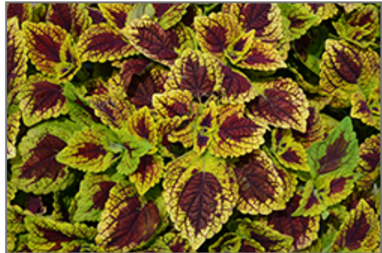
Stained Glassworks Raspberry Tart Coleus foliage