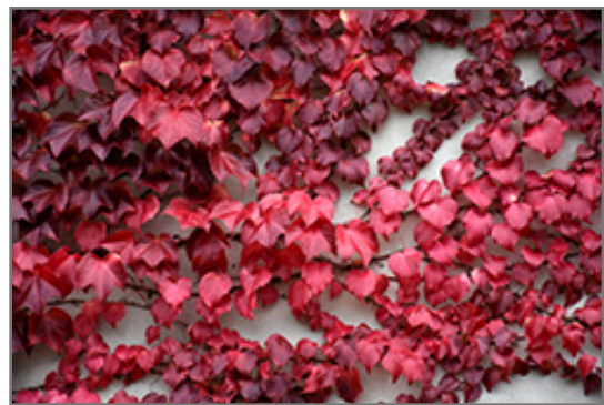
Veitch Boston Ivy in fall