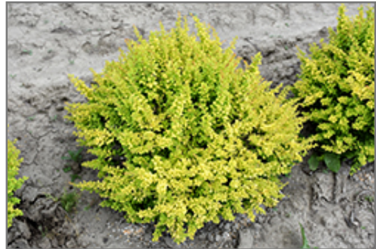
Sunsation Japanese Barberry