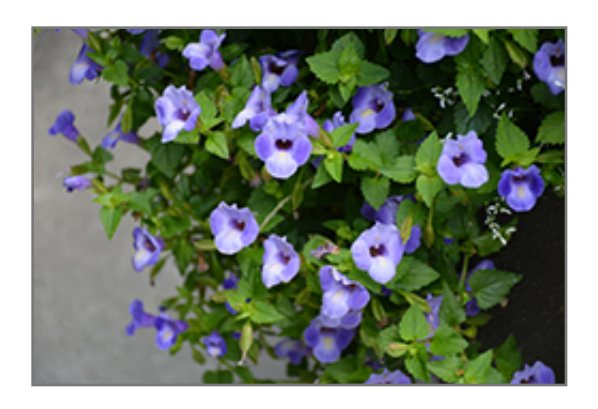
Summer Wave Large Blue Torenia flowers

Summer Wave Large Blue Torenia is recommended for the following landscape applications;