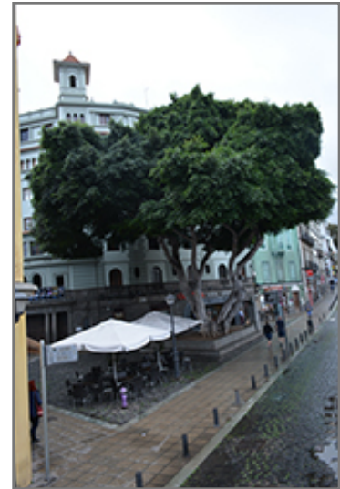
Indian Laurel Fig

Indian Laurel Fig is recommended for the following landscape applications;