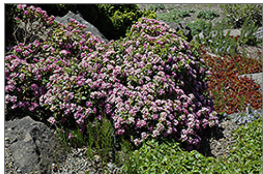
Collina Daphne in bloom