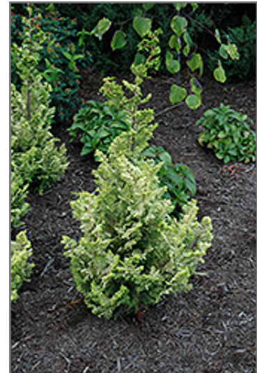
Lucas Hinoki Falsecypress