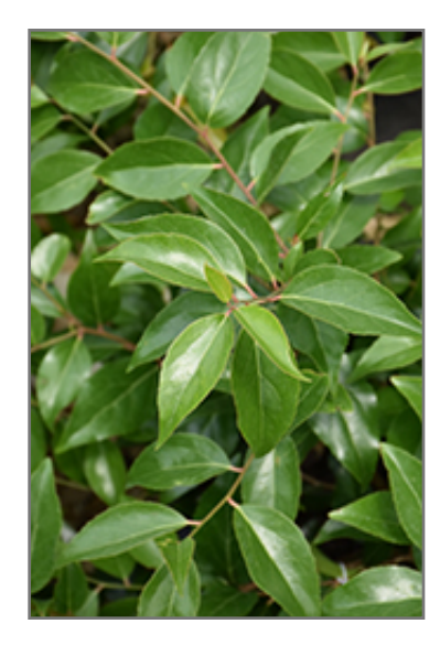
Shiny Xylosma foliage

Shiny Xylosma is recommended for the following landscape applications;