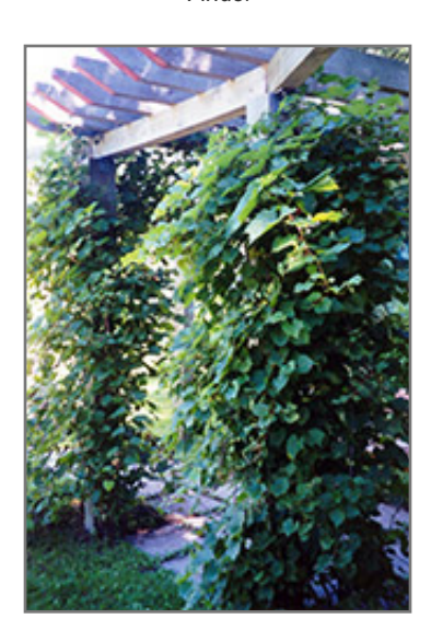
Common Grape