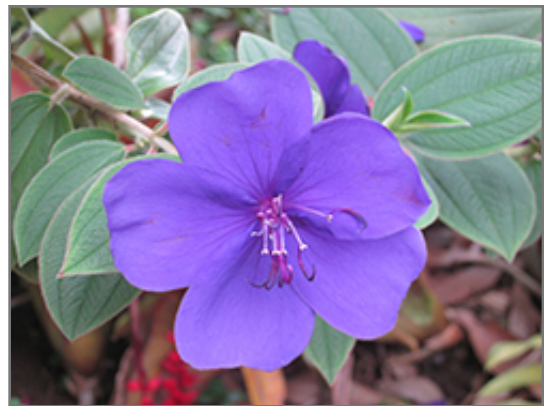
Princess Flower flowers

Princess Flower is an open multi-stemmed evergreen shrub with an upright spreading habit of growth. Its average texture blends into the landscape, but can be balanced by one or two finer or coarser trees or shrubs for an effective composition.