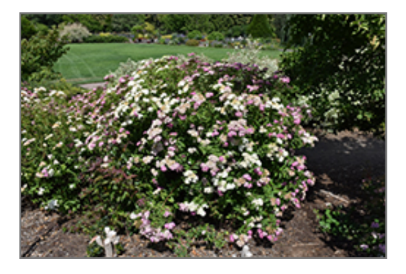
Shirobana Spirea in bloom