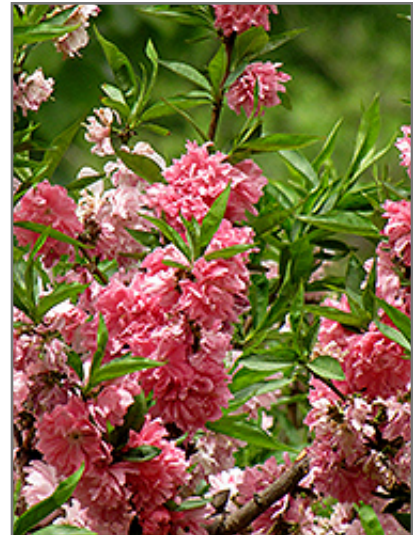
Klara Meyer Flowering Peach flowers

This tree will require occasional maintenance and upkeep, and is best pruned in late winter once the threat of extreme cold has passed. Gardeners should be aware of the following characteristic(s) that may warrant special consideration;