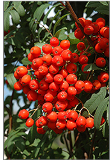
Pyramidal Mountain Ash fruit

Pyramidal Mountain Ash is recommended for the following landscape applications;