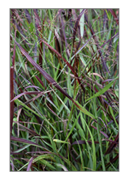
Cheyenne Sky Switch Grass flowers