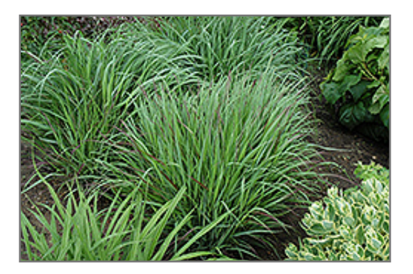
Cheyenne Sky Switch Grass

Cheyenne Sky Switch Grass will grow to be about 24 inches tall at maturity extending to 3 feet tall with the flowers, with a spread of 24 inches. It tends to be leggy, with a typical clearance of 1 foot from the ground, and should be underplanted with lower-growing perennials. It grows at a medium rate, and under ideal conditions can be expected to live for approximately 15 years. As an herbaceous perennial, this plant will usually die back to the crown each winter, and will regrow from the base each spring. Be careful not to disturb the crown in late winter when it may not be readily seen!