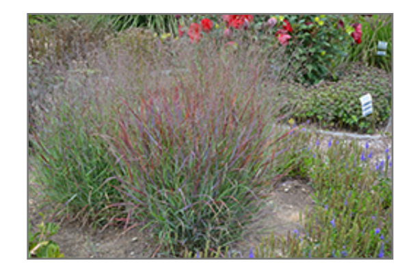
Cheyenne Sky Switch Grass

Cheyenne Sky Switch Grass is recommended for the following landscape applications;