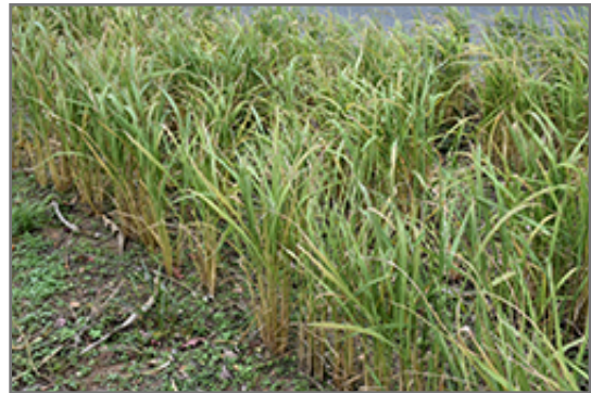
Asian Rice