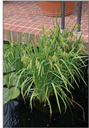
Asian Rice in bloom