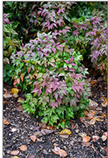
Blush Pink Nandina in fall