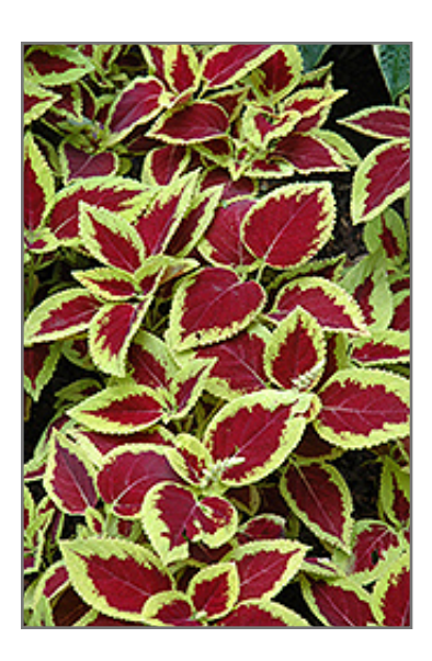
Fireball Coleus foliage

Fireball Coleus will grow to be about 18 inches tall at maturity, with a spread of 12 inches. When grown in masses or used as a bedding plant, individual plants should be spaced approximately 10 inches apart. Although it's not a true annual, this fast-growing plant can be expected to behave as an annual in our climate if left outdoors over the winter, usually needing replacement the following year. As such, gardeners should take into consideration that it will perform differently than it would in its native habitat.