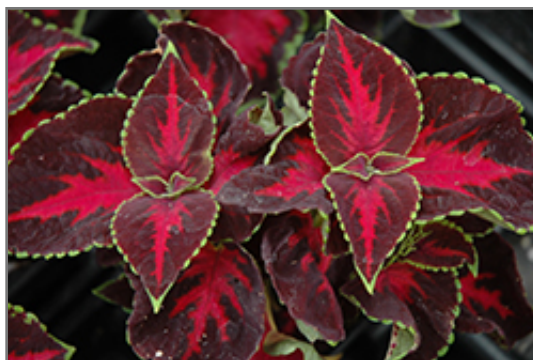
Chocolate Covered Cherry Coleus foliage