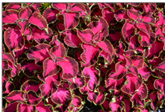
Chocolate Covered Cherry Coleus foliage

Chocolate Covered Cherry Coleus is a fine choice for the garden, but it is also a good selection for planting in outdoor containers and hanging baskets. It is often used as a 'filler' in the 'spiller-thriller-filler' container combination, providing a canvas of foliage against which the larger thriller plants stand out. Note that when growing plants in outdoor containers and baskets, they may require more frequent waterings than they would in the yard or garden.