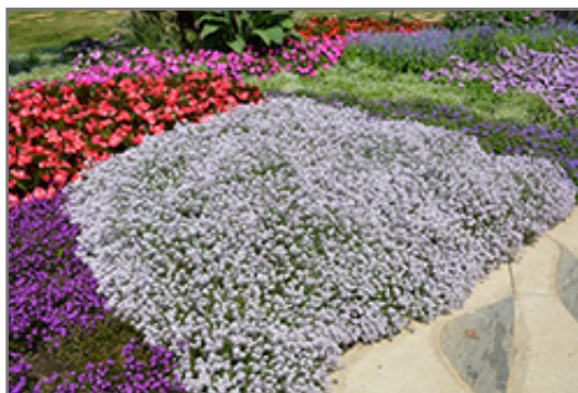
Blushing Princess Sweet Alyssum in bloom