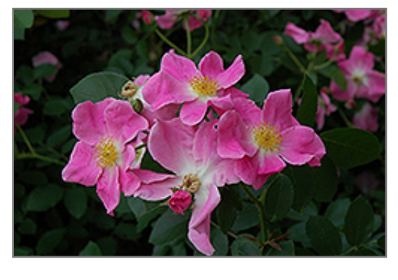
Nearly Wild Rose flowers