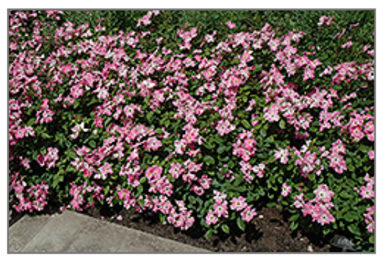
Nearly Wild Rose in bloom