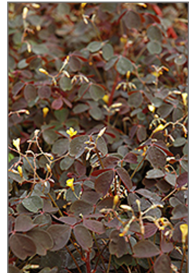
Burgundy Bliss Shamrock flowers