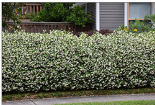
Confederate Star-Jasmine in bloom